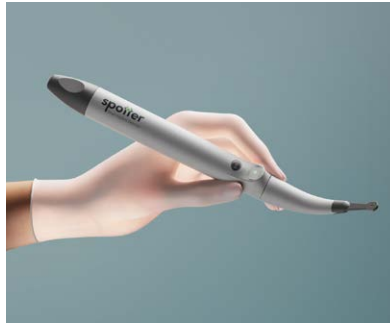
Ergonomic design for a more comfortable grip