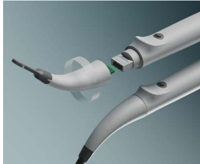
The sensor holder can be adjusted to facilitate detection of implant in both upper and lower jaw