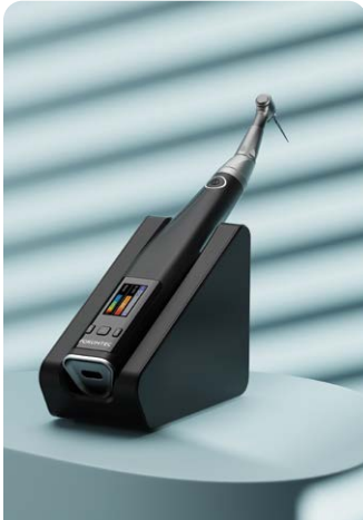
Statera vi Endo Motor

Innovative solutions and cutting-edge technology, that empower dental professionals to achieve unparalleled success in their practices.