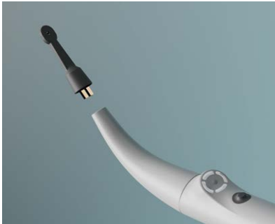
Detachable sensor heads for easy sterilization