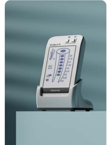
RomiApex A15 Apex Locator