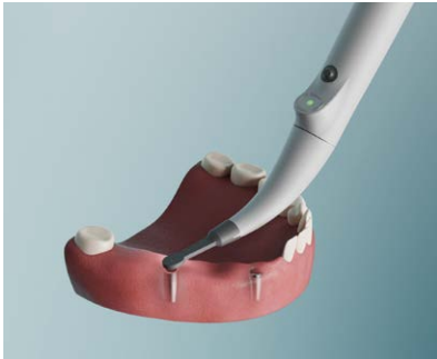
Accurate detection of the center of buried implant