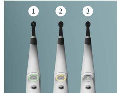
Led indicators show the sensor's progress as it approaches the implant