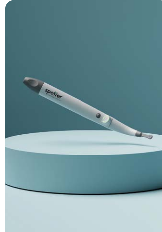
Spotter Implant Detector