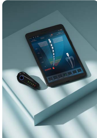
Wirele-X Apex Locator